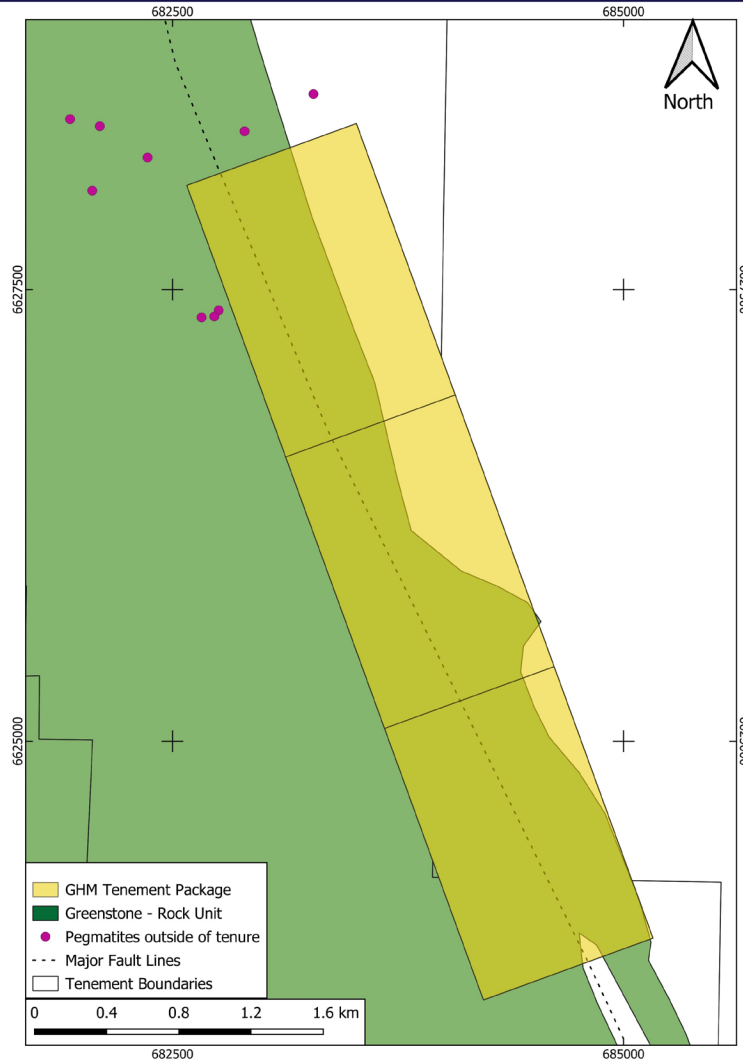
Figure 4: Newfield East project with pegmatites outside of tenure.