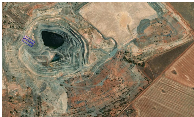
Figure 5: P77/4357 located at the Copperhead Mine.

The lease is highly prospective for gold mineralization, given its location, with the Copperhead mine estimated to have produced approximately 1.5 Moz Au.