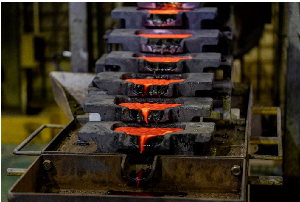
Figure 1: First gold poured from processing of the mineralised stockpile at Pilot.

During the Quarter ending September 30, 2023, the Company continued implementing its Southern Cross consolidation strategy with a number strategic acquisition within the highly prospective Southern Cross greenstone belt.