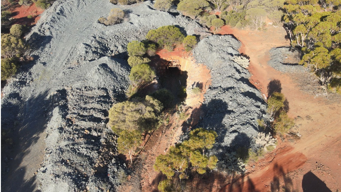
Figure 3: Birthday Mine Portal.

The Birthday tenements cover 0.6km 2 and are located 30km north of Bullfinch. The tenements encompass a series of historic underground gold mining operations at Birthday, Birthday Extended, Birthday South, Birthday West, and Birthday West Extended.