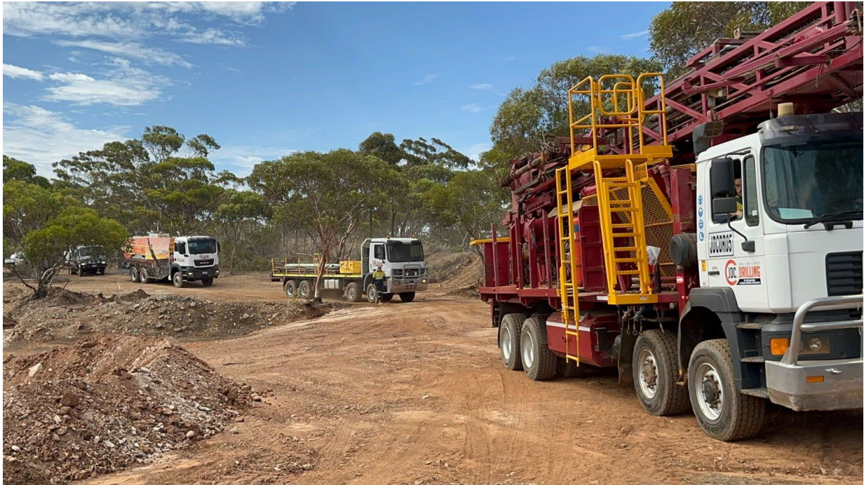
Figure 1: Drill rigs arriving at Hopes Hill prospect.